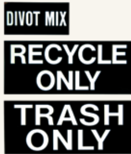
Decals DCL - DIVOT MIX (1.5" h x 3" w) $1 DCL - RECYCLE ONLY (2.5" h x 6" w) $2 DCL - TRASH ONLY (2.5" h x 6" w) $2