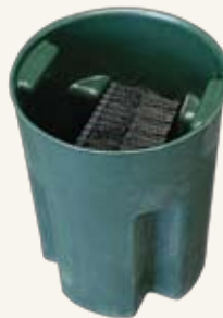
Classic Club Washer Liner & Brushes P-695 (liner w/brushes) $275 P-405 (brushes only) $79 ea.