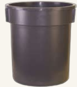
Round Replacement Liners TC10RL (10 gal) $20 TC20RL (20 gal) $25 TC32RL (32 gal) $34 TC40RL (40 gal) $40 TC55RL (55 gal) $85