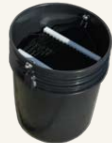
Standard Club Washer Liner & Brushes P-77854 (liner w/brushes) $173