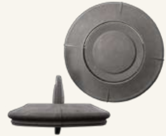
Bee-Free Swinging Lids BFLID (15 & 25 gal) $44