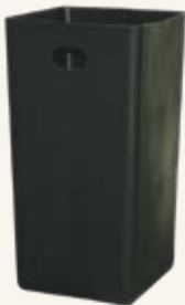
Square Replacement Liners 12GLR (12 gal) $21 13GLR (13 gal) $32 26GLR (26 gal) $36 38GLR (38 gal) $45 45GLR (45 gal) $49