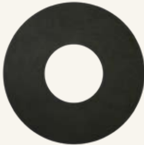
Round Replacement Lids TCL10 (10 gal) $25 TCL20 (20 gal) $26 TCL32 (32 gal) $31 TCL55 (55 gal) $39