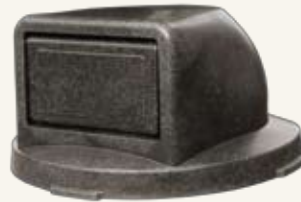
Replacement Dome Lid SDT (black) $78