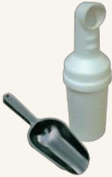
Divot Bottle & Scoop P-849BK (scoop) $1 P-DMQC (bottle) $9