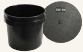
Round Divot Lid & Liner (DMC & DMC35) P-DML35 (3.5 gallon liner) $7 DMLF35 (lid) $28