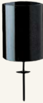
Divot Bottle Holder P-BSS241 (for use with Bayco DMCQ) $19